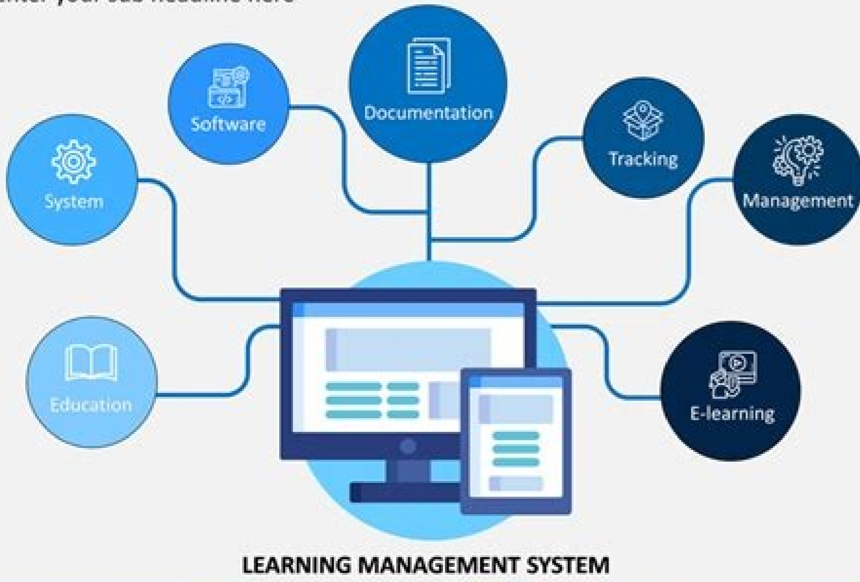
LEARNING MANAGEMENT SYSTEM